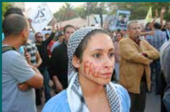
"Liberty deep in the heart of the people", Rabat