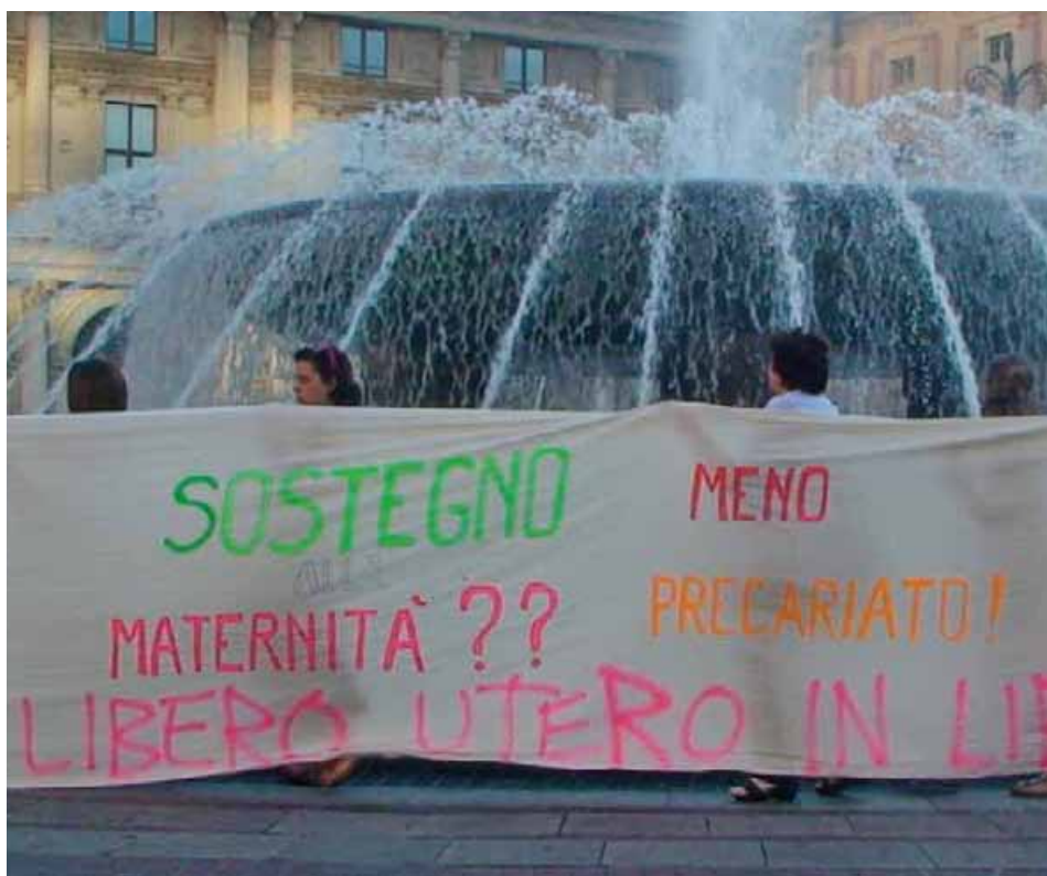
Meeting of the Maeva women's Forum, in Genoa

To find out more about all of the projects, visit the information page of our website www.medwomensund.org